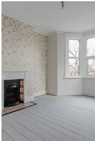
Broad Street, Barry, CF62 7AD